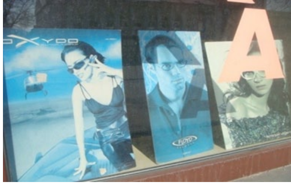
Image 5. Advertisement of sunglasses in Alytus