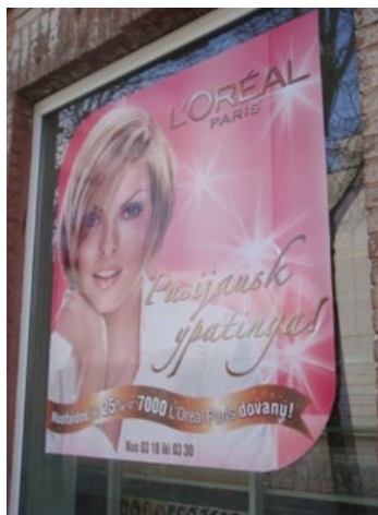
Image 2. Advertisement of the cosmetics line LHYPERL Paris in Alytus

tion links the idea behind the brand with the depicted woman (the ‘target’ woman whom one wants to resemble) and the potential customer.