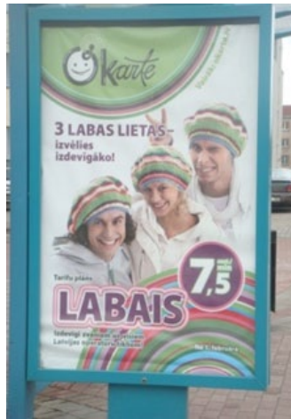
Image 4. Advertisement of O karte in Daugavpils