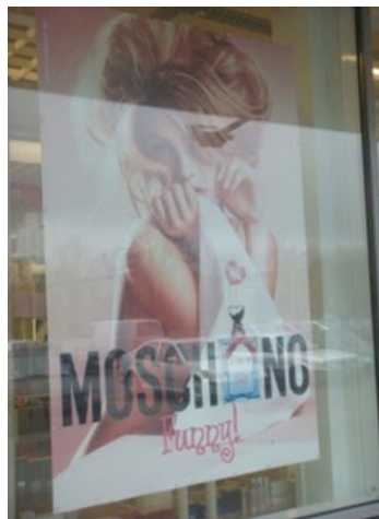
Image 3. Advertisement of perfume Moschino Funny in Pärnu

In public advertising, a woman is commonly represented in the form of a temptress, one that is externally characterized by sexual attraction and dressing provocatively (scant clothing and exposed parts of the body décolleté and long legs), and by gazing in a way that is perceived as coquettish, (lips slightly open, while a faint smile can be glimpsed), secretly implying that the woman is longing for intimacy and sexual pleasure (see Image 3).