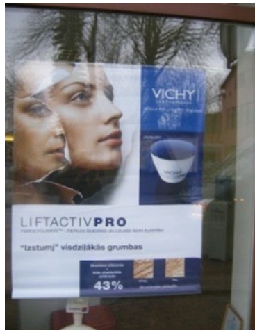
Image 1. Advertisement of facial cream Vichy in Ventspils